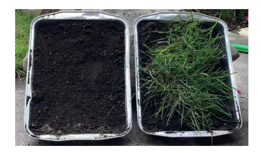
plain soil grassy sod