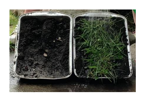
plain soil grassy sod